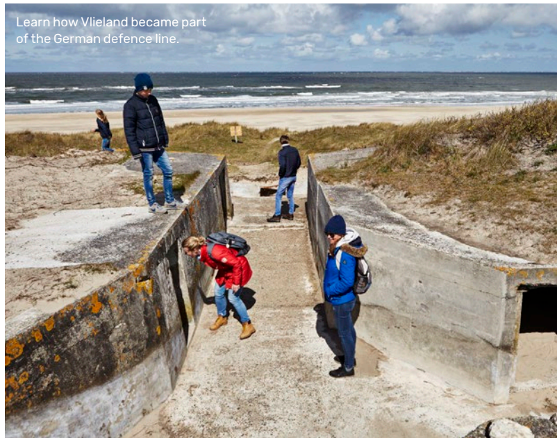
Learn how Vlieland became part of the German defence line.

This 'rather sensitive' military heritage was neglected for a very long time or used as a stall, storage or holiday home. Only in the past few years have many parts of the Atlantic Wall become accessible again. Take an adventurous journey to these areas in North Holland and Friesland and experience the stories behind this fascinating bit of heritage.