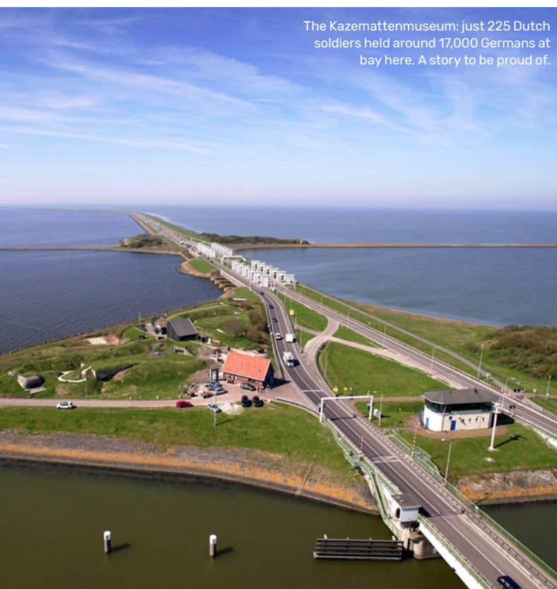
The Kazemattenmuseum: just 225 Dutch soldiers held around 17,000 Germans at bay here. A story to be proud of.