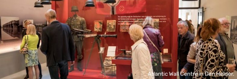
Atlantic Wall Centre in Den Helder.